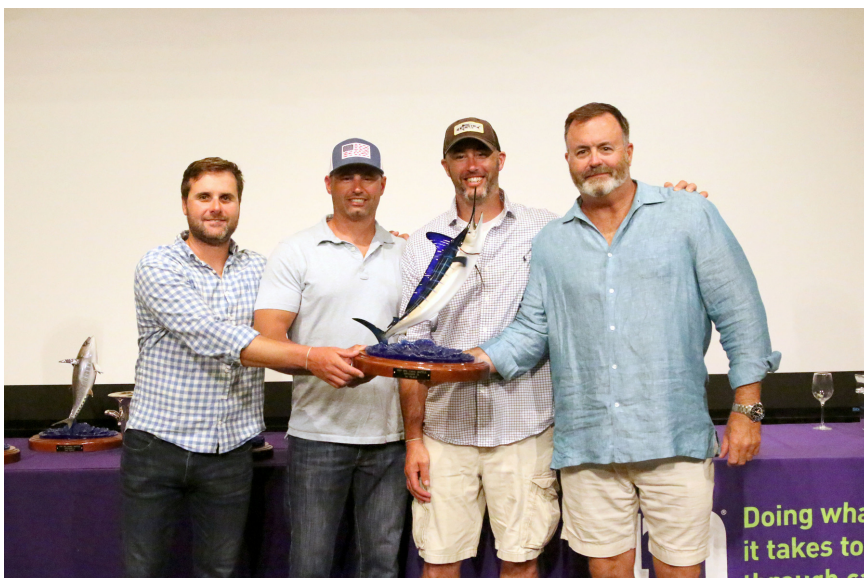
DIV II - 1st Place - Trashy Thoughts