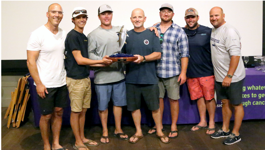
DIV I - 2nd Place - Castafari/Rainmaker