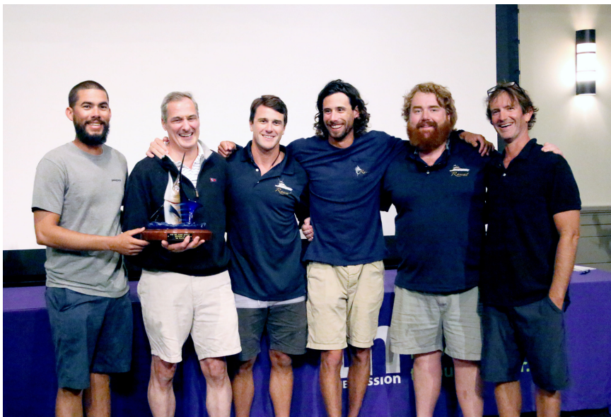
DIV I - 3rd Place - Rascal