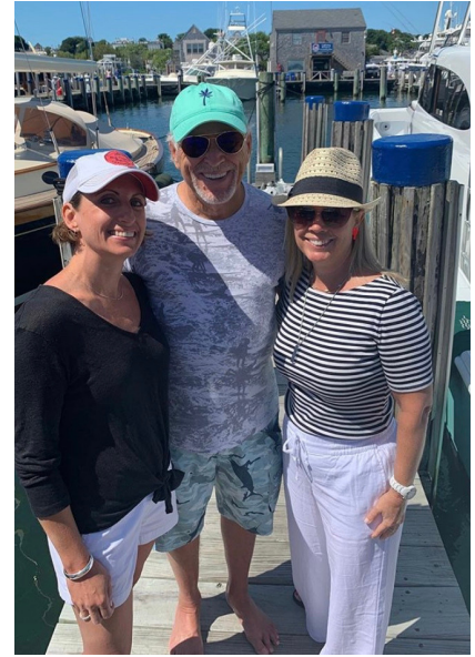
Jimmy Buffet with an impromptu performance on the docks.