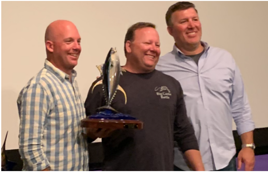
DIV II - 2nd Place - Stir it Up