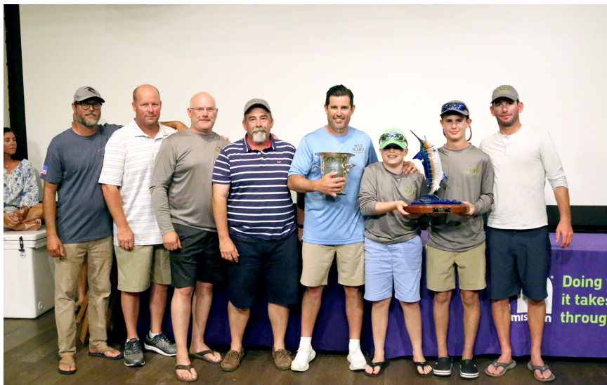
DIV I - 1st Place and Tourney Winner - Scup Slayer