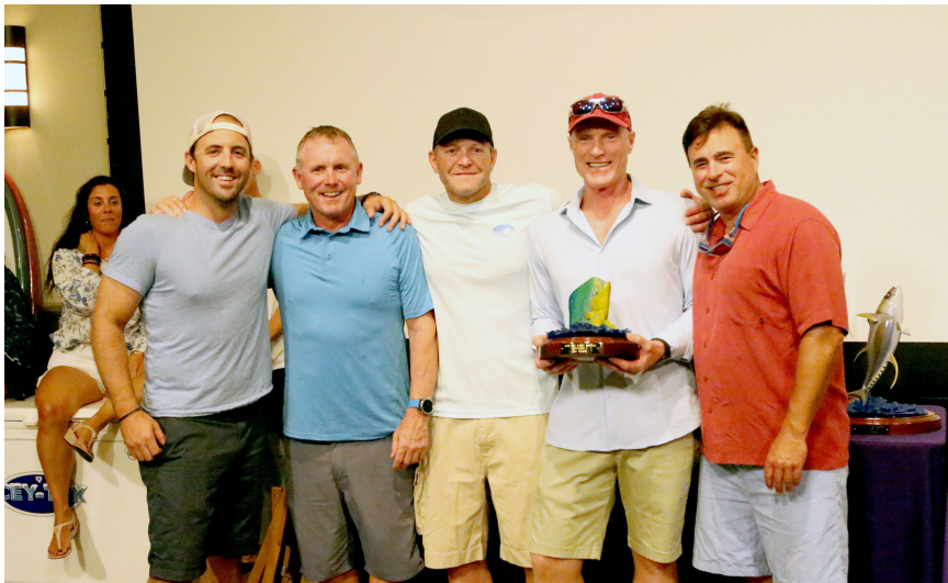
DIV II - 3rd Place - Loose Cannon